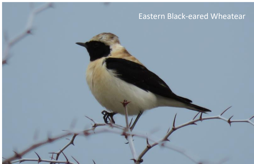
Eastern Black-eared Wheatear

The area below the dam can be reached quite easily by parking on the rough ground on the eastern end of the dam and walking down the rough track. Cyprus Warbler had been reported at the base of the dam, where there is a good section of rocky scrub with broom, but I only had a multitude of Sardinian Warblers here, along with plenty of Chukar and Cetti's Warblers. Returning to a view over the dam on this second visit added a couple of Alpine Swifts to the haul, along with a single Great White Egret at the reservoir edges.